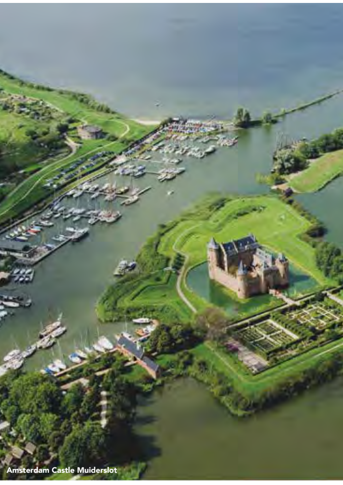
Amsterdam Castle Muiderstol

125 Amsterdam Castle Muiderstol Muiderstol is the most famous knight's castle in the Netherlands, a true medieval water stronghold on the River Vecht. Open Apr-Oct Mon-Fri 10:00-17:00, Sat & Sun 12:00-17:00, Nov-Mar Sat & Sun only 12:00-17:00. Closed 1 Jan, 25 & 31 Dec. Herengracht 1, Muiden; www.muiderstol.nl